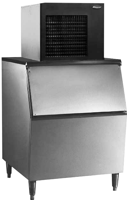
MCD400ABT icemaker shown on Follett 425-30 ice storage bin, sold separately

Compact, reliable icemaker for use with Follett ice storage bins. Stainless steel exterior with easily removable modern-style plastic facade. Both air- and water-cooled models use environmentally friendly R404A refrigerant. Production capacity up to 400 lbs (181 kg) of Chewblet ice in a 24-hour period.