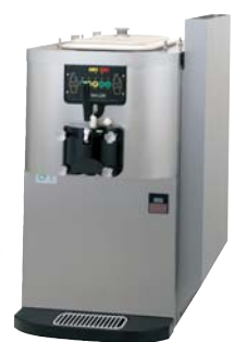
Optional Top Air Discharge Chute

Rockton, Illinois 61072 800-255-0626 Phone 815-624-8333 Fax 815-624-8000 www.taylor-company.com e-mail: info@taylor-company.com